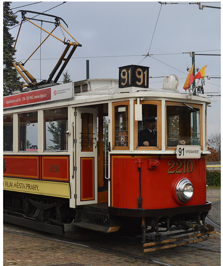
The classic red Prague tram shuttles passengers through the charming streets of the city.

The bugs: Dr. Marie Carmen Collado, (Spain) emphasized the importance of exposure to intestinal microbes in infancy. Such exposure affects health and disease in later life through programming of immune and metabolic pathways. Dr. Collado reported that an infant’s microbial gut colonization begins in utero as a result of contact with maternal microbiota in the placenta and in amniotic fluid. 23 Researchers continue to learn about colonization via human milk and other pathways, such as contact during delivery and postpartum skin touch with breastfeeding. 24, 25