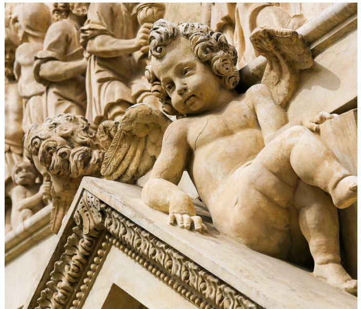
The Baroque façade of the Loreto Chapel highlights this pilgrimage site and historic monument in the Castle District of Prague.